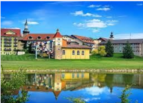
September 16-18, 2024 Bavarian Inn Lodge Frankenmuth, MI

Join us in the Fall of 2024 as we venture to new and exciting places! Embark on a journey to Little Bavaria within the borders of Michigan as we explore the charm of Frankenmuth for a singular lower peninsula conference September 16—18, 2024. For our members in the Upper Peninsula, you've spoken and we've listened! We will be holding two one-day conferences servicing our members and guests with stops in the Central and Eastern UP. Join us on September 23rd at Marquette-Alger RESA and on September 24th in Harris at the Island Resort & Casino. The UP conference will encompass a comprehensive range of essential content, building upon the insights shared in Frankenmuth. Moreover, tailored sessions will focus specifically on addressing the unique needs of our UP population.