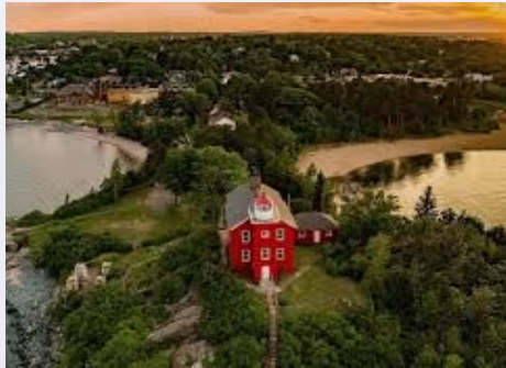
September 23, 2024 Marquette-Alger RESA Marquette, MI