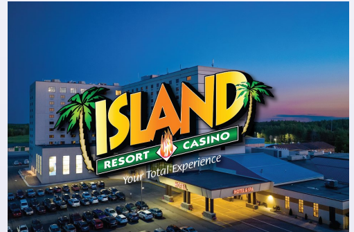
September 24, 2024 Island Resort & Casino Harris, MI